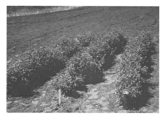
FIG. 1. Experimental planting of Echium plantagineum in the Snake River Valley near Wawawai, Washington. These plants have attained a height of 14-16 in.

For some time a conjugated C_{18} -tetraenoid fatty acid—9,11,13,15-octadecatetraenoic acid—has been known as a constituent of Parinarium laurinum oil and of oils from several species of Impatiens (6).